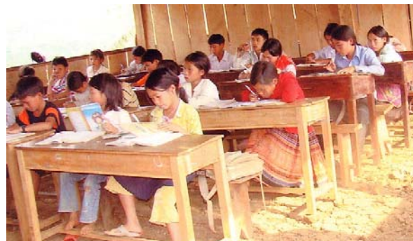
A classroom at Kim Đồng Primary School in Đắk Nông

www.vietnamfoundation.org.au PO Box 57 Sans Souci, NSW 2219 ABN 60 071 999 838 * CFN 15347